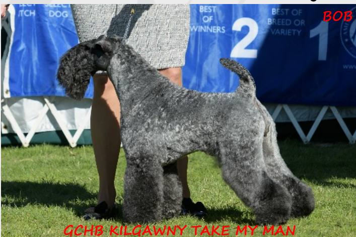
GCHB KILGAWNY TAKE MY MAN